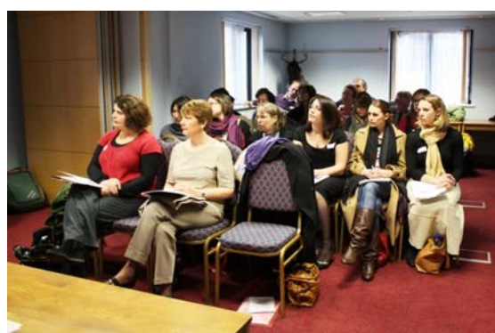
'Ageing, Care and Health' panel, Deakin Room