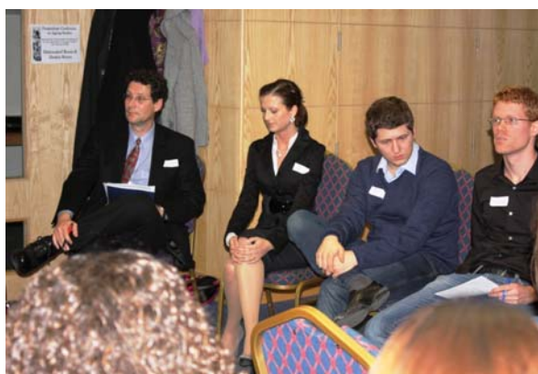
'Ageing and Intergenerational Relations' panel, Dahrendorf Room

Two parallel student presentation sessions 'Ageing, Care and Health' and 'Ageing and Intergenerational Relations' were held in the afternoon.