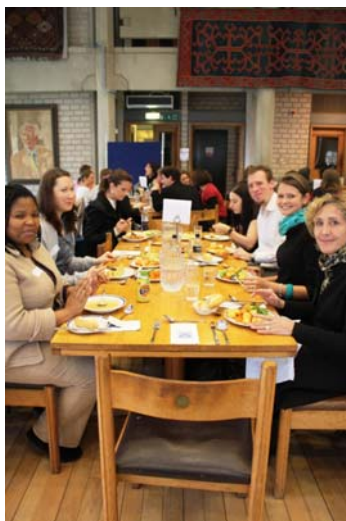
Lunch at Dining Hall, St. Antony's, provided a chance for networking among participants.

After the first student panel, participants had lunch at the college dining hall which provided a chance for networking.