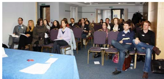
'Ageing and Work' panel, Dahrendorf Room