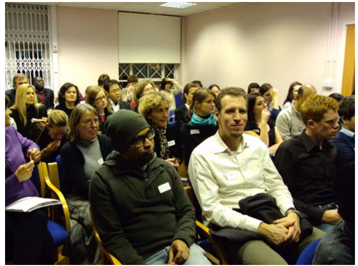
Left: Expert Discussion Forum at Lecture Theatre, Oxford Institute of Ageing