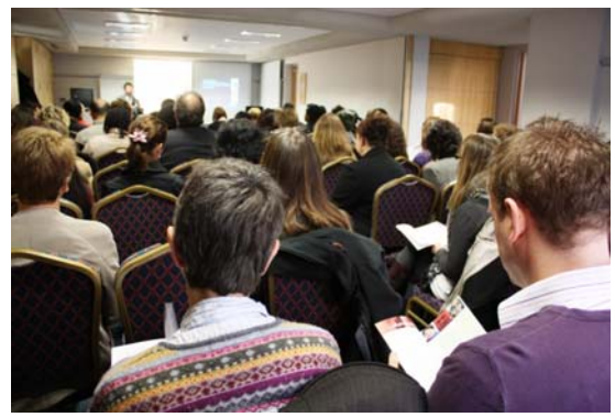
Left and Right: Conference Delegates