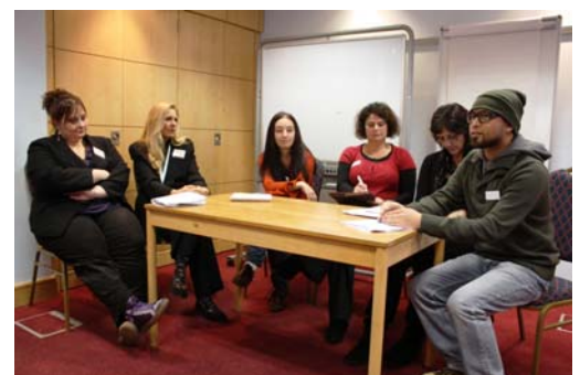
'Ageing and Gender' panel, Deakin Room