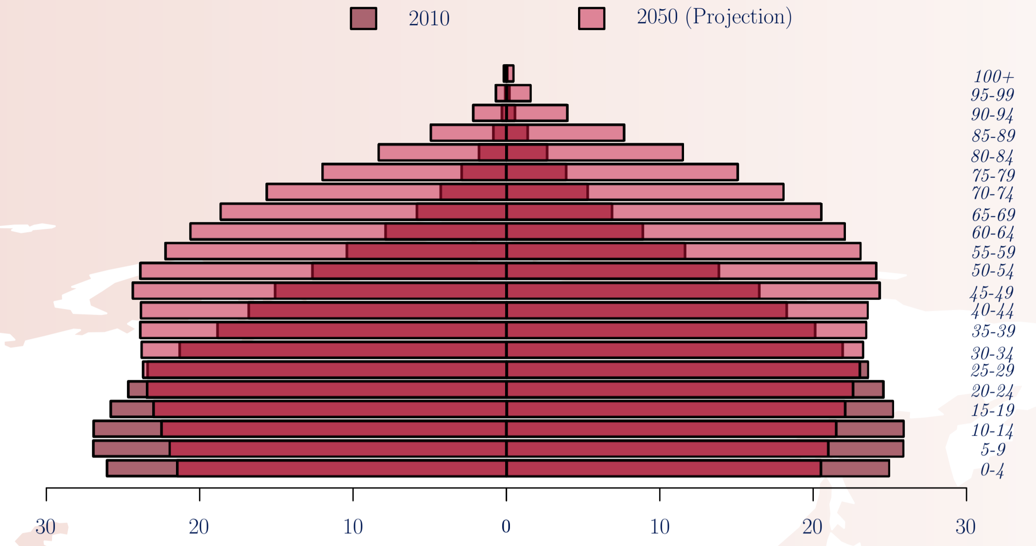
Figure: Population pyramid for Latin America - 5 year groups, current estimate and 2050 projection in millions (UN 2013)

In developing such programmes LARNA draws on directions and approaches identified by the strategic plan and framework for research on ageing in Latin America developed out of the July 2009 Oxford Conference on Developing the Research Agenda .