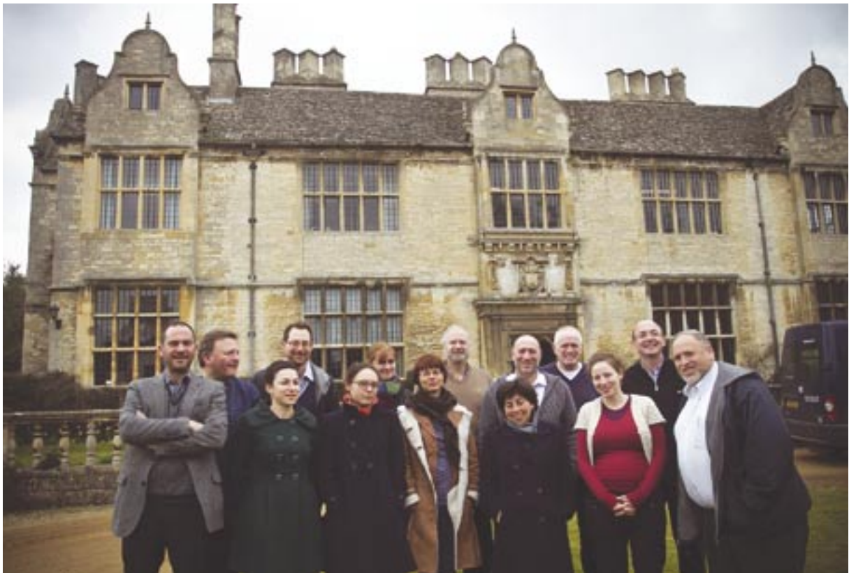
The participants of the Social Welfare Committee Think Tank: Envisioning the Future of Social Welfare 2012-2025 – Yarnton Manor, Oxford

Video: For an inside look at the Social Welfare Committee Think Tank, we invite you to watch the official video at: http://vimeo.com/39468526